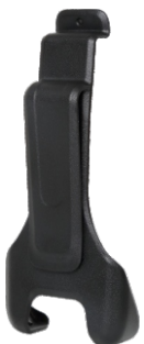
PD355 Belt Clip