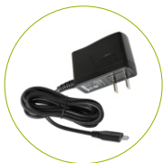
Micro USB Power Adapter (5V/1A)