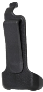
PD365 Belt Clip