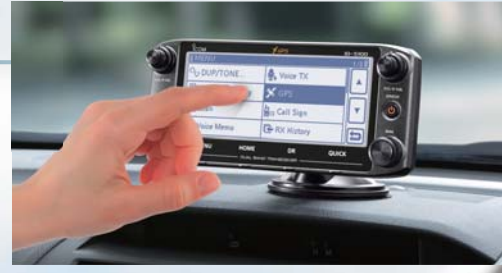
Vehicle installation example (Using optional MBF-1 mount base and MBA-2 controller bracket)