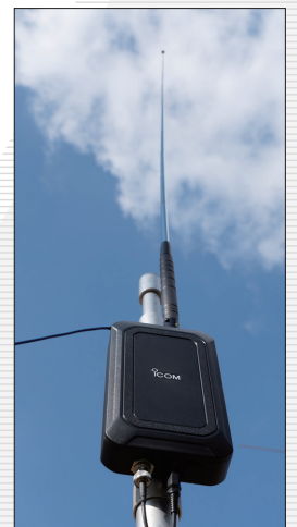
50 Ω antenna example