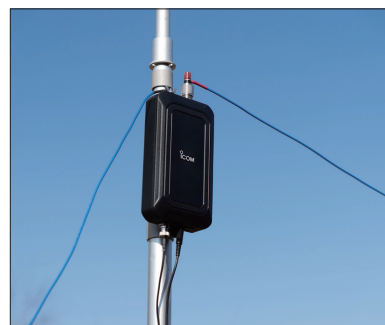
Wire antenna installation example