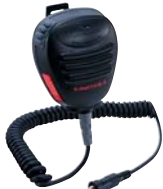
Submersible Mic Plug