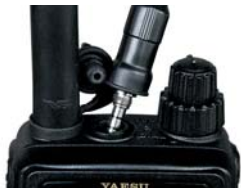
Waterproof Connectors and Microphone Jack